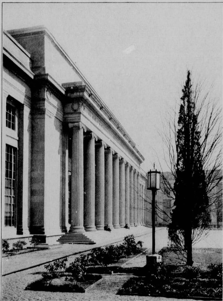
MAIN ENTRANCE FROM EASTMAN COURT