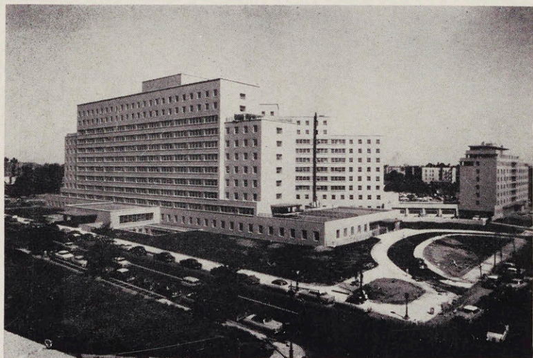
CITY HOSPITAL, Elmhurst, New York