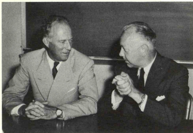
King and Chancellor