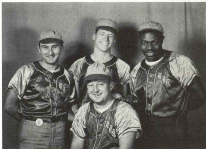
No star like a rocket

For next year, one thing is certain: The Rockets ain't moving west.